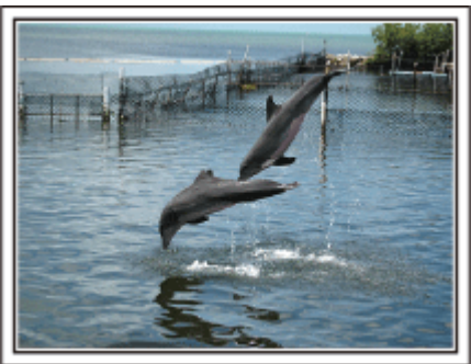
Photo by justthatgoodguyjim <u>Creative Commons Attribution-No Derivative Works 3.0</u> Video Playback in Progress

Shots with the eyes closed are often taken by accident. To reduce such mistakes, make use of the function to capture still images from videos. As videos are actually continuous recording of 60 still images within 1 minute, using this function allows you to select the best moment and save it as a still image.