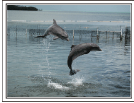
Photo by justthatgoodguyjim Creative Commons Attribution-No Derivative Works 3.0 Video Playback in Progress