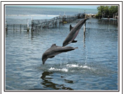
Photo by justthatgoodguyjim <u>Creative Commons Attribution-No Derivative Works 3.0</u> Video Playback in Progress

Shots with the eyes closed are often taken by accident. To reduce such mistakes, make use of the function to capture still images from videos. As videos are actually continuous recording of 60 still images within 1 minute, using this function allows you to select the best moment and save it as a still image.