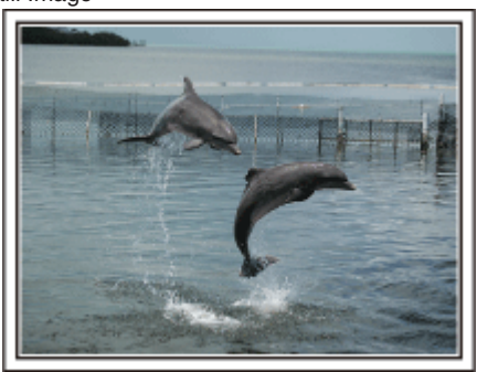
Photo by justthatgoodguyjim <u>Creative Commons Attribution-No Derivative Works 3.0</u> Video Playback in Progress