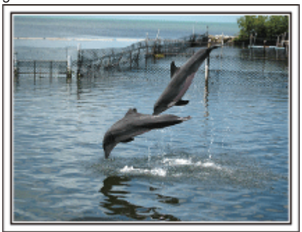
Photo by justthatgoodguyjim <u>Creative Commons Attribution-No Derivative Works 3.0</u> Video Playback in Progress

Shots with the eyes closed are often taken by accident. To reduce such mistakes, make use of the function to capture still images from videos. As videos are actually continuous recording of 60 still images within 1 minute, using this function allows you to select the best moment and save it as a still image.